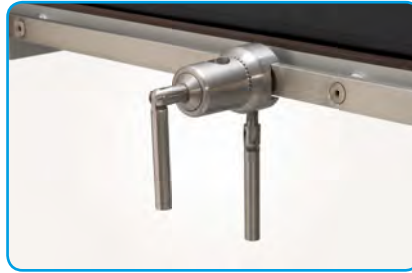
10-304 Radial Clamp