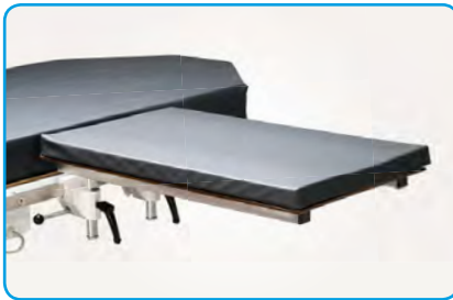
10-390-K Arm & Hand Surgery Table