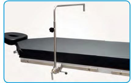
10-310 Anesthesia Frame