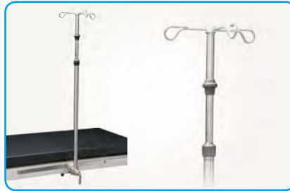
10-402 Infusion Stand