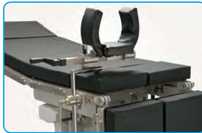
10-353 Knee Arthroscopy Holder