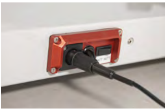
Connection for battery charger.