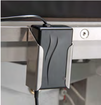
Battery charger with holder.