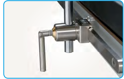
10-305 Radial clamp "hook-on"