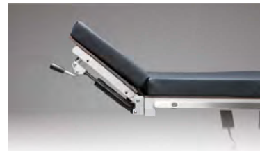
Head rest up: 50°

Double swivel castors for easy manouvering.