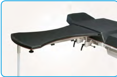
10-390 Arm & Hand Surgery Table