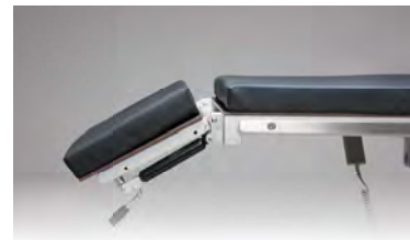
Head rest down: 20°