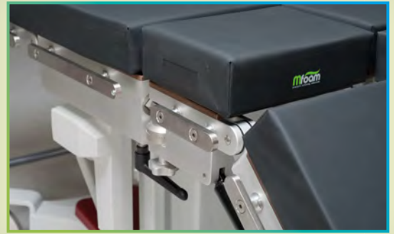
Split 4-sectional leg section, gas spring operated. Detachable, 90° swivelling.