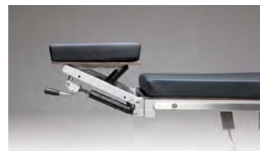
For patient in lateral position