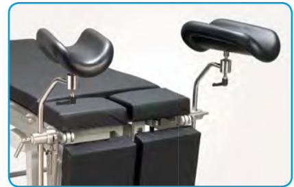
10-450 Leg Holders with Ball Joint