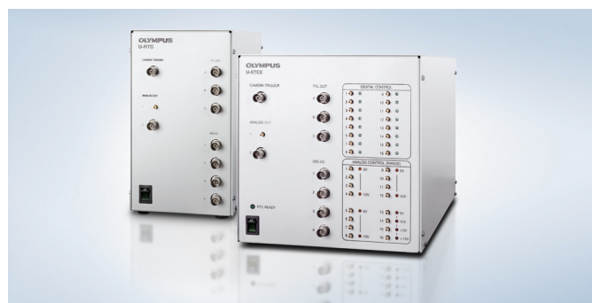
Olympus Real-Time Controllers RTC and RTCE