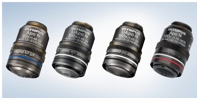
Olympus UIS2 objectives dedicated to TIRF imaging.

The high-end solution of the cellTIRF family offers two or four completely independent beam paths. This ensures not only perfect individual alignment for every laser line but also allows for truly simultaneous acquisition at the same penetration depth for each wavelength. These features are ideally suited for fast multi-color live cell imaging. In contrast to the one-line laser option cellTIRF-1L, the MITICO device is also able to perform widefield fluorescence imaging simultaneous and in parallel to TIRF acquisition. In addition, one of the laser ports is equipped with an integrated point-FRAP option.